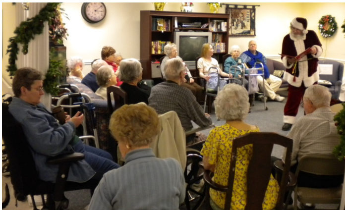
Pictured at Left: Residents enjoy a visit from the big guy himself, Santa Claus. Santa flew in from the North Pole and made a stop at each and every building on The Orchards at Foxcrest campus including The Pepperberry Suites. Santa put on a Christmas show for everyone in attendance and wrapped his stay up by giving gifts to every resident on the "Nice" list!

gift to each one. Most of the residents sat on Santa's lap and he asked what they would like for Christmas this year. Refreshments were then served and everyone had a wonderful time.